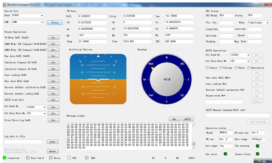
Pic 3 IMU610 assistant

IMU 610 Assistant software is used to debug, configure IMU520 as pic 3 below: